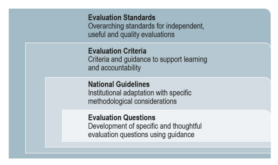
Figure 2.1. How the criteria fit in with other norms and standards