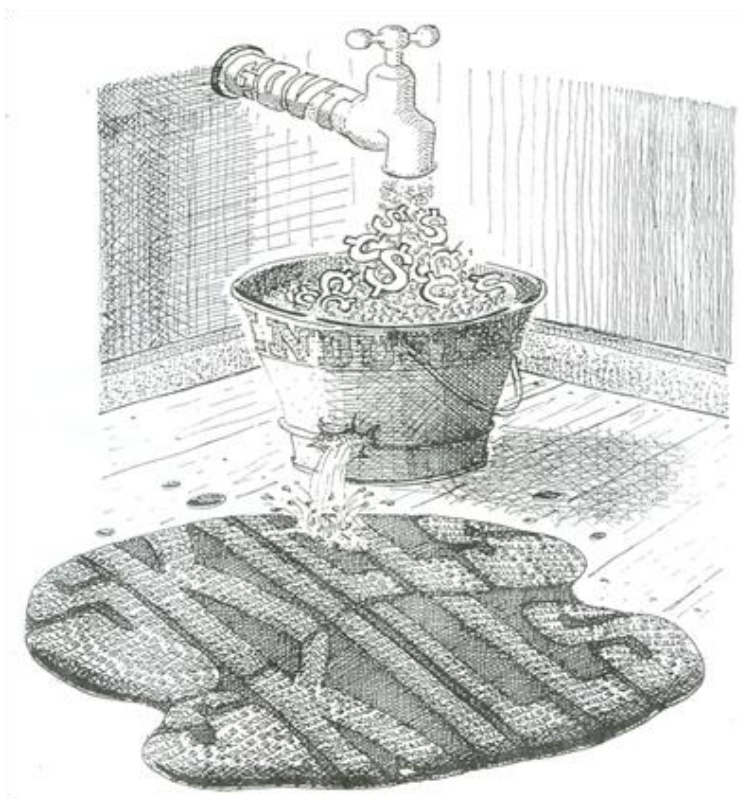
Figure 2. A supply-side skills system: a bucket leaking skills

technology, business systems and processes and good workforce management practices, continuing a mainly supply-side only skills system was like pouring dollars into a leaky bucket (see Figure 2).