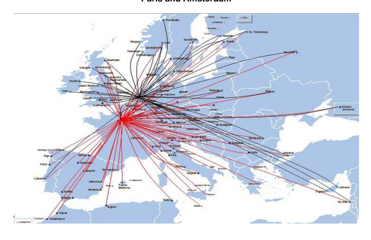
Figure 2. Air France and KLM Merged Network: Paris and Amsterdam

In summary, airport dominance allows a carrier to achieve hub premium and enjoy other related advantages. An airline prefers to have its own exclusive hub rather than to share a same airport with other carrier's hub function. While a carrier may set up an optimal multiple hub network for continental coverage, it can not afford to have more than one hub within a region. All of these factors indicate the following: