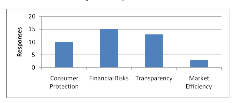
Figure 2: Policy Concerns