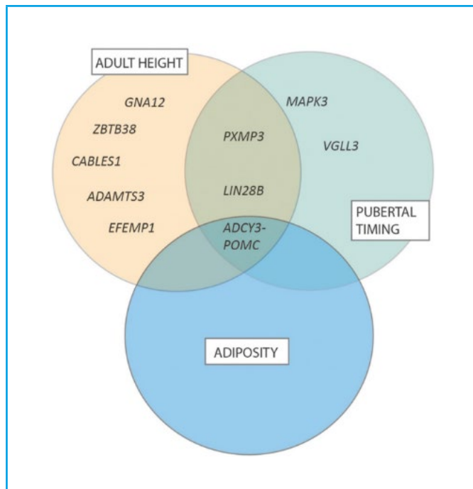
Figure 3. LOCI Associated with Pubertal Height and their Overlap with Pubertal Timing and Adiposity (6)

GWAS reveal an overlap of genes responsible for stature potential, pubertal timing and adiposity [1]. Two of the discovered genes correlate to both adult height and pubertal timing (PXMP3 and LIN28B). In addition, one gene discovered is responsible for three known traits including adult height, pubertal timing and adiposity (ADCY3-POMC) (see Figure 3). This finding suggests the feasibility of CUG during puberty given underlying genetic pathways and elucidates the complexity which still exists.