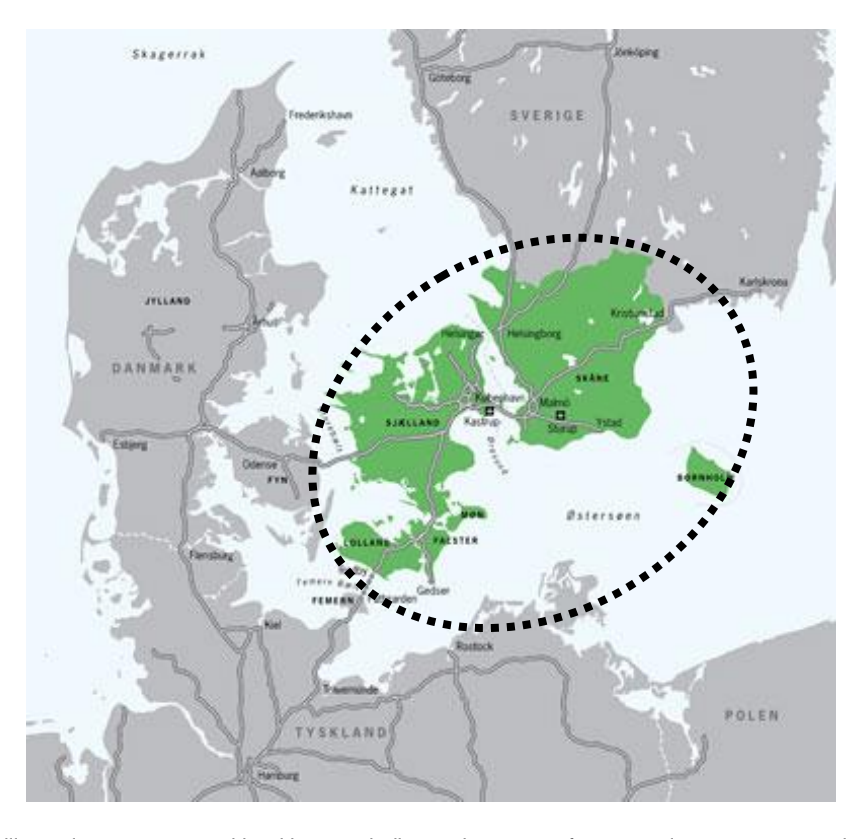
Figure 1.1. The Oresund cross-border region

region of Skåne (33 municipalities), all three being located near or along the sound. The core of the Oresund is on the Copenhagen-Malmö link. A northern fast ferry link over the 4-kilometer wide sound exists as well, between Helsingborg (92 000 inhabitants) and the closest point to Denmark (city of Helsingør) (Figure 1.1).