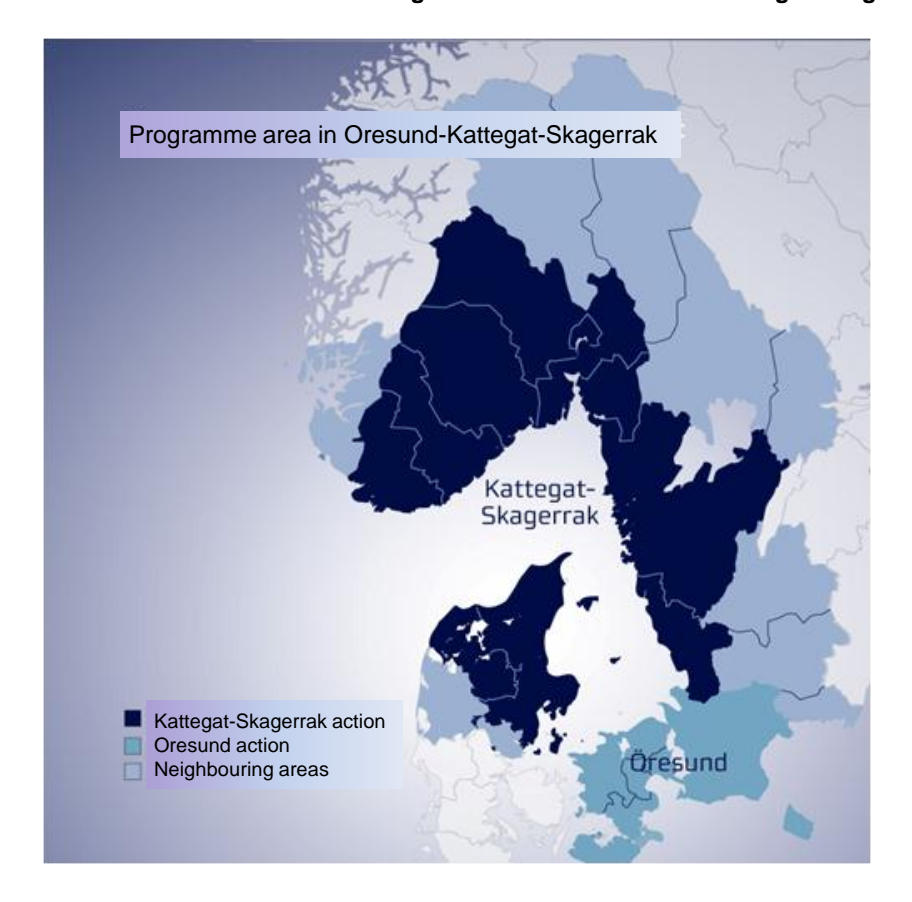
Figure 1.2. The Oresund cross-border region in the wider Oresund-Kattegat-Skagerrak area

end of the Danish Oresund, will reduce the transport time between Copenhagen and Hamburg and further improve the external connectivity of the entire Oresund to the south. Looking north, there are opportunities for the corridor to extend to Göteborg (Sweden) and Oslo (Norway). On an even larger scale, the Oresund is also part of the Baltic Sea macro-region, which provides opportunities for other types of connections with surrounding countries, notably in terms of participating in joint long-distance communication infrastructure, addressing wider environmental challenges and sharing of large scientific infrastructure.