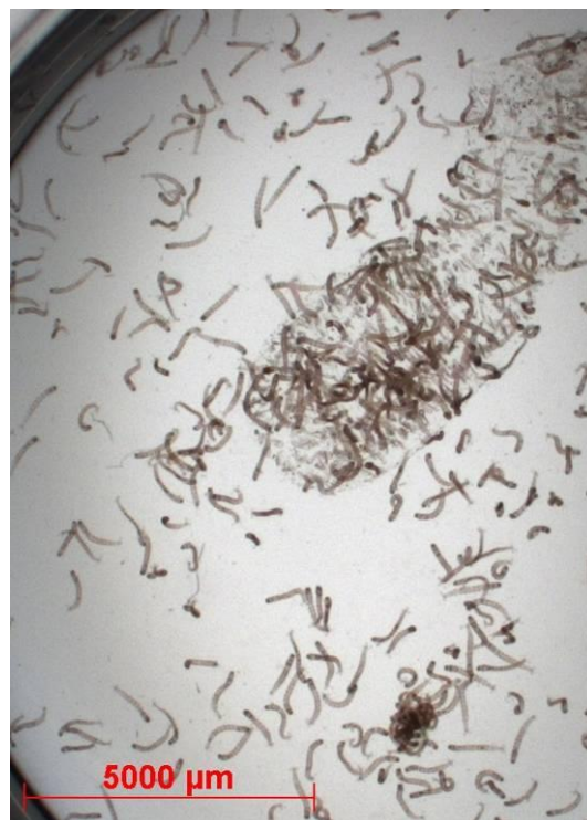
Figure 2: First-instar larvae from an almost completely hatched egg mass of C. riparius (21)

17. Larvae should not be fed during the test. However, feeding prior to exposure (i.e. directly after hatching) is important in order to ensure \geq 85\% survival of the larvae in the controls at the end of the exposure period. A few droplets of filtrate from finely ground suspension of flaked fish-food (e.g. Tetra-Min or Tetra-Phyll, see also (11) in the amount of 0.05-0.5 mg per larva should be sufficient for young larvae. Green algae have also been suggested as a food source (10) (11), but care should be taken when larvae are added to the test vessels not to “inoculate” the test medium with algae, which may influence test compound availability. As an alternative to flaked fish-food, plant material may be used, for example