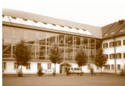
AHS Collegium Mehrerau, Austria

A learning information and communication centre in Austria