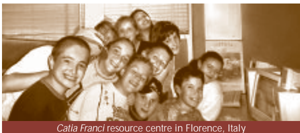
Catia Franci resource centre in Florence, Italy