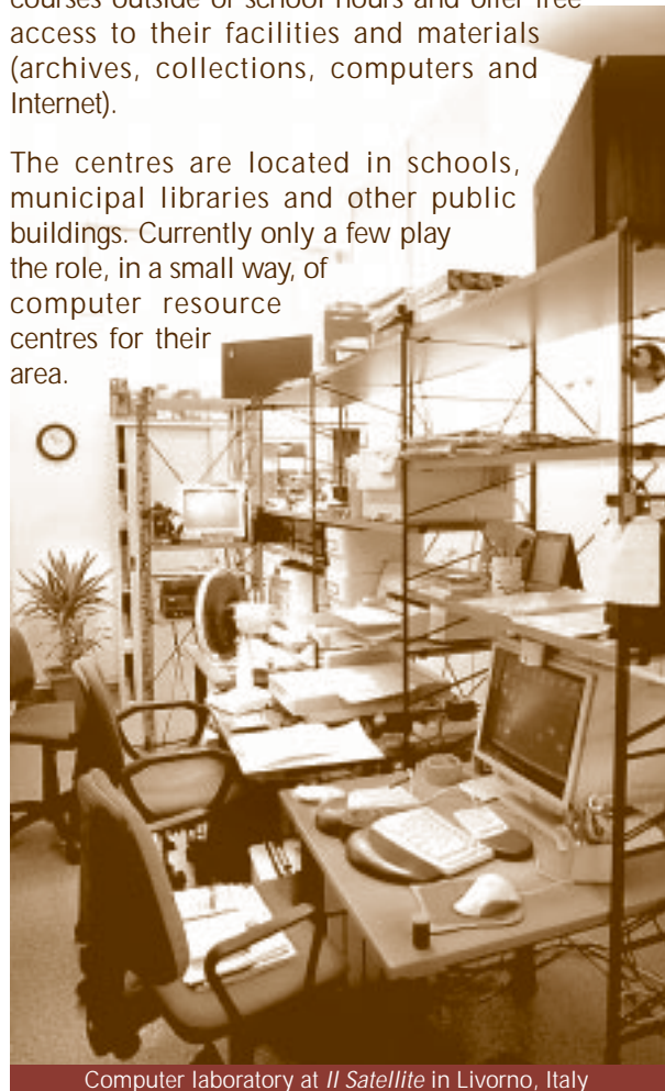
Computer laboratory at II Satellite in Livorno, Italy

The centres are located in schools, municipal libraries and other public buildings. Currently only a few play the role, in a small way, of computer resource centres for their area.