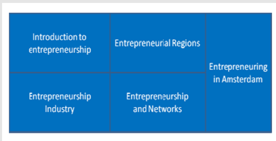
Figure 1. The structure and courses of the Minor Entrepreneurship

The Minor is delivered in the first semester of the year (September till the end of January) and the semester is divided into three periods: