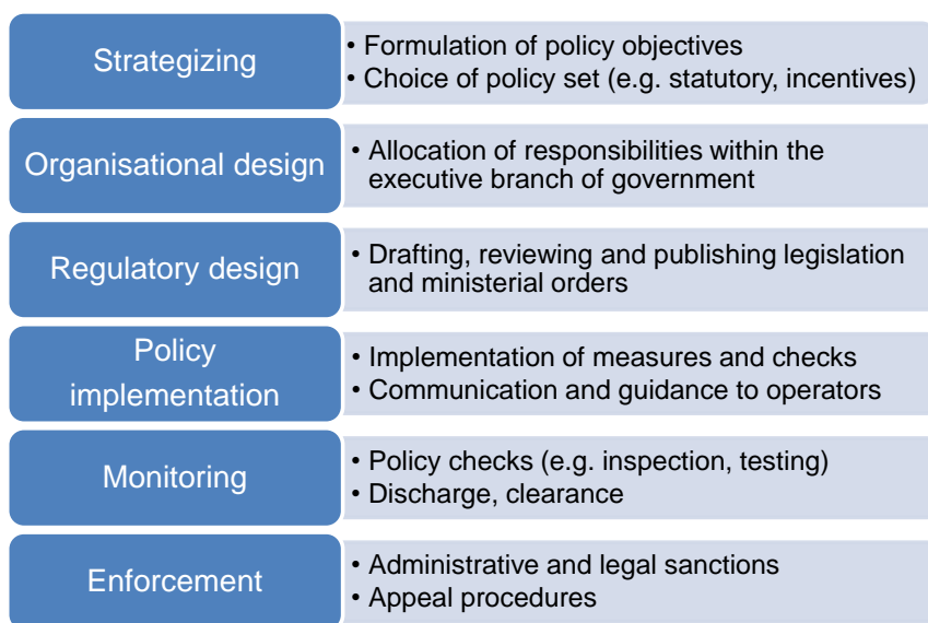
Figure 2. Sequences and main actors in the policy process

Finally, the measures are enforced through administrative sanctions provided by the Control Authority and the Competent Authority (e.g., reductions in payment, fines, suspension of licence, plant closure) and eventually through legal sanctions in courts.