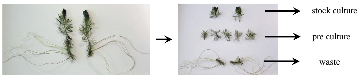
Figure 1: Cutting of plants for the stock and pre culture after 3 weeks of cultivation.

Apices as well as segments of the stem middle part for this renewed culture can be used. Number and size of transferred plants (or segments of plants) are dependent on how many plants are needed. For example, you can transfer five shoot segments into one Fernbach flask and three shoot segments into one Erlenmeyer flask, each with a length of 5 cm. Discard any rooted, flowering, dead or otherwise conspicuous parts.