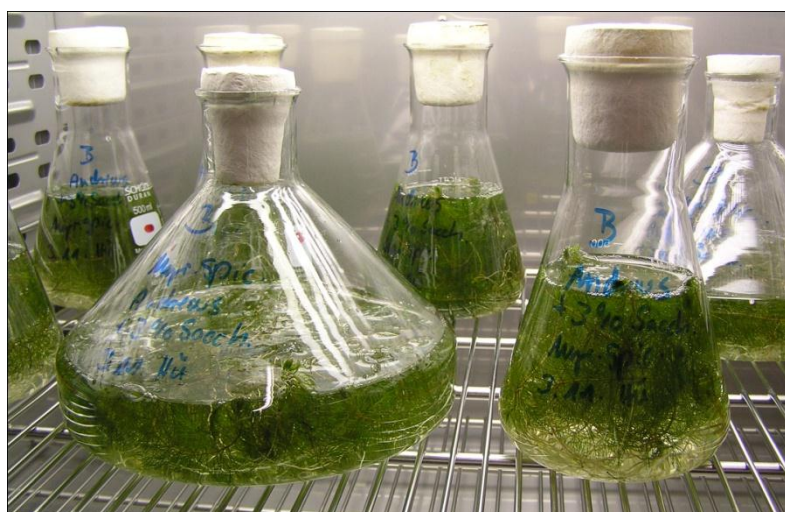
Figure 2: Culturing of plants in a cooling incubator with chamber illumination.

Culturing of plants is to be performed in 500 ml Erlenmeyer and 2000 ml Fernbach flasks in a cooling incubator at 20 \pm 2 \text{ }^\circ\text{C} with continuously light at approximately 100\text{-}150 \mu\text{E m}^{-2} \text{s}^{-1} or 6000-9000 Lux (emitted by chamber illumination with colour temperature "warm white light").