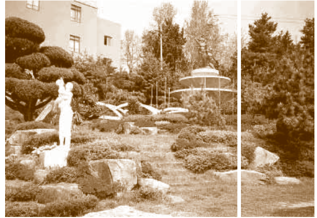
Entrance to the Fragrance Garden at the Gochang Girls High School in North Cholla Province