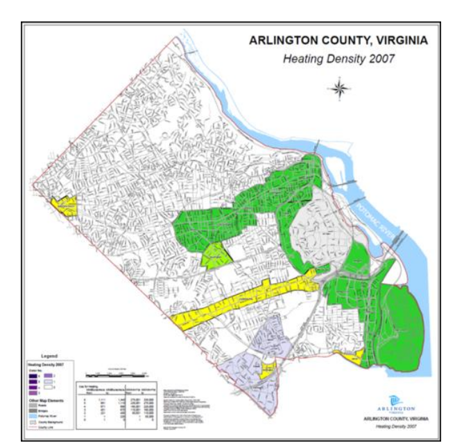
Figure 2: Arlington County – Potential District Energy Zones

Arlington has the benefit of a long-term history with promoting density in urban planning and transitoriented development, especially along the Ballston-Rosslyn corridor and Crystal City. As a result, the Arlington CEP has assessed that district energy is could be a viable option in much of the county. It is proposed in the Arlington CEP that high-density areas such as Crystal City and the Ballston-Rosslyn Corridor have the potential to economically transition towards neighbourhood-scale district energy systems starting as early as 2015.