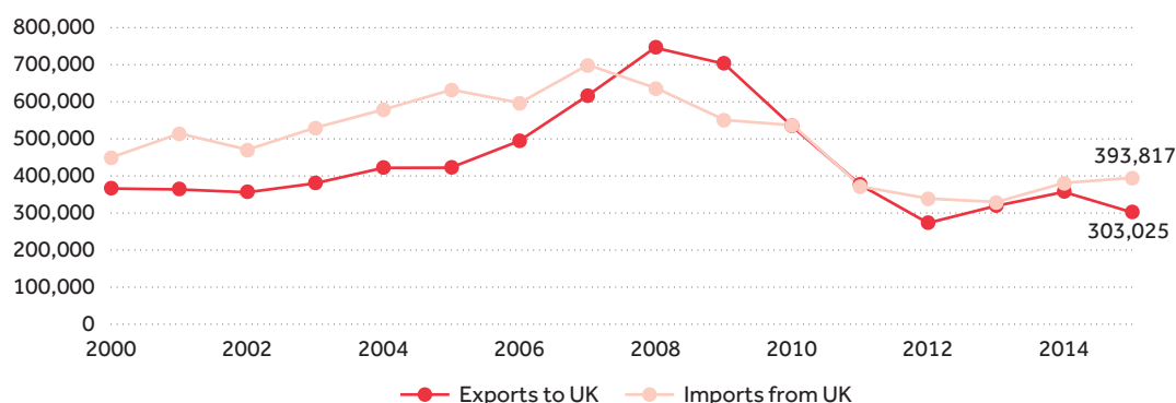
Figure 2. CARIFORUM countries' trade with the UK (in US$1,000): 2000–2015