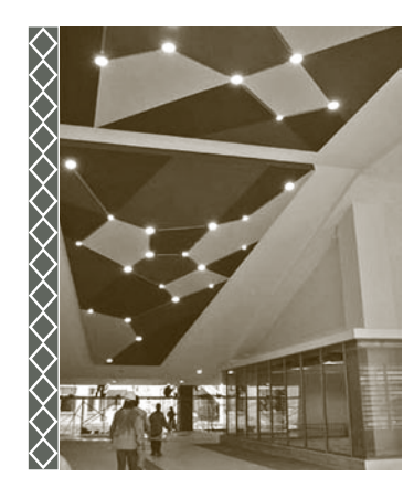
Ceiling patterns relating to constellations, Victoria School, Singapore (CPG Consultants Pte Ltd)

School walls commonly serve as a silent backdrop for posters and other educational displays. Is it not possible for walls and other elements to be active components in the learning process, with their own stories to tell? Wouldn't learning be so much more fun if building elements became life-sized props enabling students to link mathematics, music, culture and arts through an engaging and participatory process? For example, windows can be placed on the wall to suggest musical notes of a familiar song, floor patterns can be inspired by geometrical shapes, the school façade can speak of the culture and tradition of the community which it serves, or the ceiling of the lobby can reflect the mysteries of stars and constellations. Doors, windows and entryways can become playful objects to teach about shapes, sizes and patterns. Columns can provide texture and scent, and planar elements can become dynamic canvases that capture the varying moods created by light and shadow, enhancing students' awareness of changing conditions at different times of the day, and teaching about concepts of lightness and transparency.