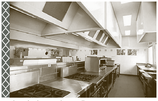
Cooking facilities at the Goulburn Ovens Institute of TAFE, Seymour Campus, Seymour, Australia

Specialised facilities are required for these subjects but not all schools are able to provide for them. Networks of schools and technical colleges have therefore been formed to share this learning.