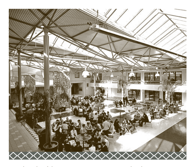
Quadrangle of the Carey Baptist Grammar School (kindergarten to year 12), Melbourne, Australia

As places of transformation, schools are increasingly required to adopt the provision of additional social services for students, their families and the wider local community. Health practitioners of various guises and other social and