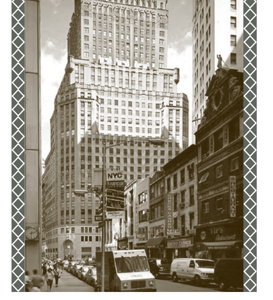
Millennium High School, housed in a commercial building near Ground Zero in New York City (architect: HLW International, planner: Fielding/Nair International)

Although school clients are leery of allowing building design to proceed without all the ground rules being set, too much pre-planning is almost as poor a way of eliciting good design as one that is too open-ended. The school system in Seattle, Washington (United States), has found a way to solve this problem by defining a set of design guidelines that are performance-based. The Seattle approach is to set the goals for design but not to limit the designer's creativity. Here is a list of performance-based guidelines that, when tailored to the situation at hand, can not only serve the design team but also help the community to evaluate the quality of the work that was done: