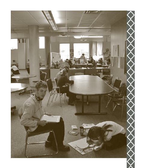
Flexible learning space at Avalon School in Minneapolis, Minnesota, United States (architect: Randall Fielding)