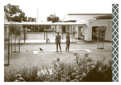
Shenton College (secondary school), Perth, Australia

Throughout history, education systems have aligned to differing purposes – often more than one at a time. Generally the four common purposes are considered to be: