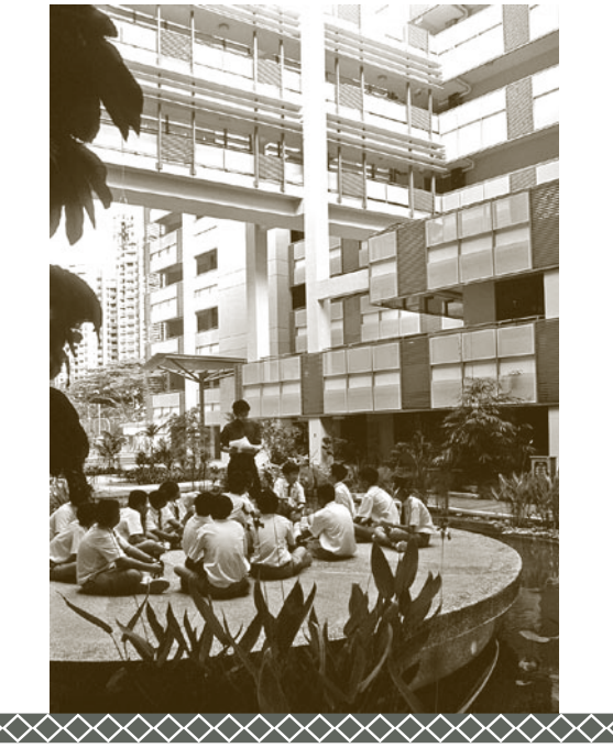
The "Outdoor Classroom", Victoria School

The second project was the redevelopment of Singapore's second oldest school, Victoria School. The outdoor spaces were redesigned to become the heart of the school itself. Its new "Eco-Street" forms the school's central artery and is the organising element for the linear plan. The boundaries between building and landscape are blurred, with linkways, bridges and footpaths weaving through the lush greenery, revealing a tapestry of nature enriched by student activity and interaction within an outdoor classroom. The Eco-Street assumes the two important roles of social and learning spaces rolled into one. In line with the school's emphasis on integrating nature and ecology into the curriculum, the Eco-Street is carefully designed as a "living laboratory", providing opportunities for hands-on experiments and examination, enabling students to learn about ecology and the life sciences.